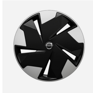
19" 5 Spoke Aero