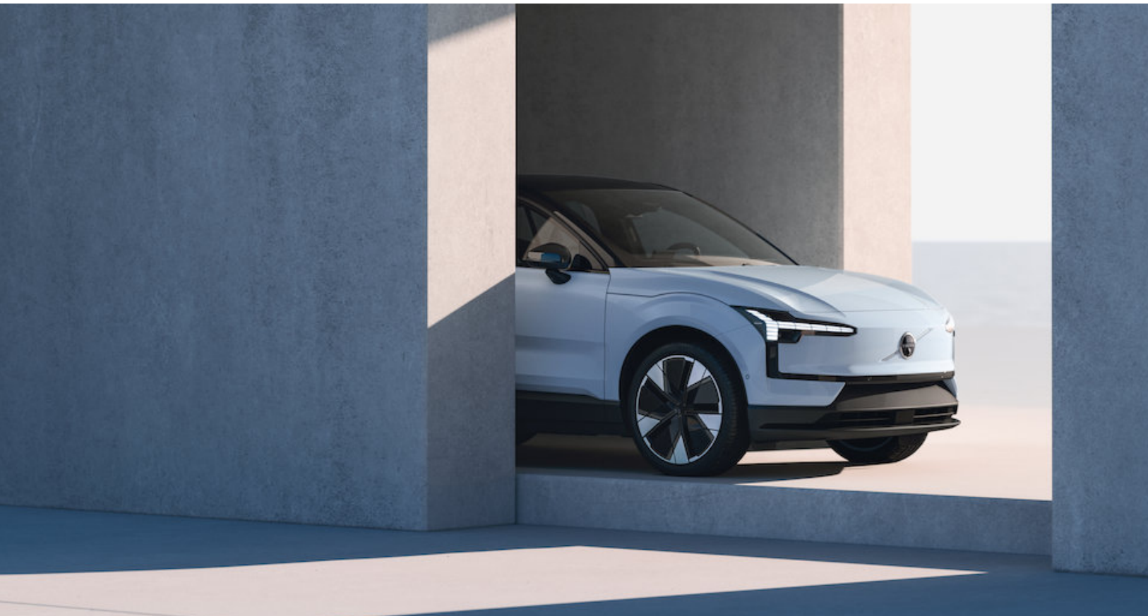
20" 5 Y-Spoke (#200026)